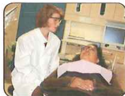
Discussing post-op instructions

To control discomfort , take pain medication before the anesthetic has worn off or as recommended.